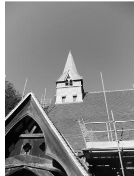
Nearing completion our 'new' church 140 years later!!