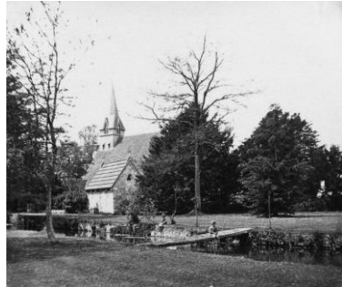
The 'new' church in 1869 from the Priory Lawn – ten years after completion