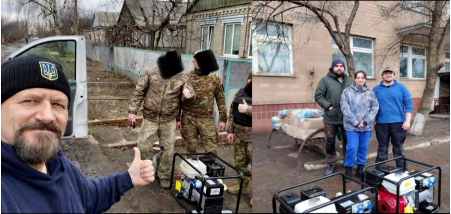
One of our generators being dropped to a battalion in the East of Ukraine

“There are no words to express our gratitude to you, the people of England. We are fighting for our freedom. They came to destroy us. You help us survive and protect the future. Everything will be fine even if we are gone. But we must defeat these orcs. Otherwise, there will be no life on the planet. Glory to Ukraine. The glory of England.